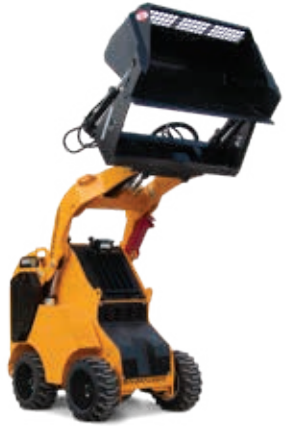
HIGH DUMP BUCKET MARTATCH

4-IN-1 BUCKET MARTATCH ROTARY MOWER MARTATCH