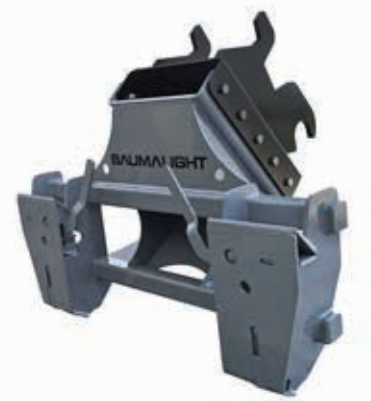
Excavator to Skidsteer Quick Attach