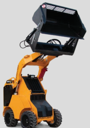
HIGH DUMP BUCKET MARTATCH

For a full list of available tools & attachments visit www.baumalight.com