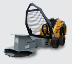
TREE SAW BAUMALIGHT