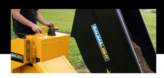
Joystick Controls DT515RH only

Tow behind Hydraulic AUX Bucket control Bucket Capacity 1 Yard (1.2 Yard Heaped) 7.25" Ground Clearance