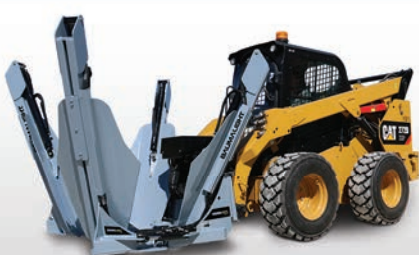
SKIDSTEER TREE SPADES

Moves spade further from wheel base to protect hoses.