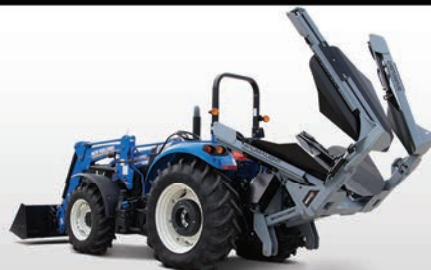
TRACTOR TREE SPADES