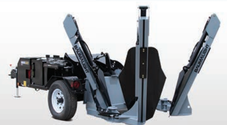
TRAILER MOUNTED TREE SPADES