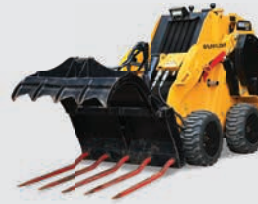
MANURE FORK & GRAPPLE MARTATCH