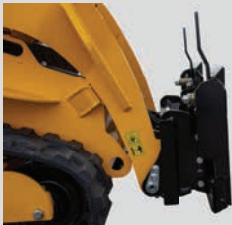
D006489 - BAUMALIGHT FM PLATE TO BOBCAT MINI MALE CHEATER