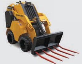
MANURE FORK MARTATCH