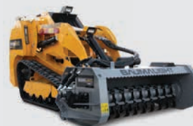
FLAIL MOWER BAUMALIGHT