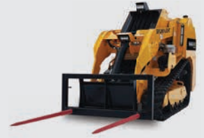
BALE SPEAR MARTATCH