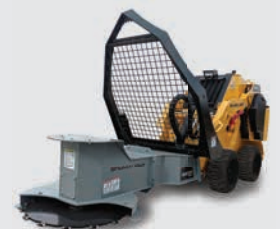
TREE SAW BAUMALIGHT