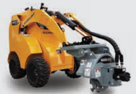
STUMP GRINDER BAUMALIGHT